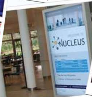
Chesterford Research Park