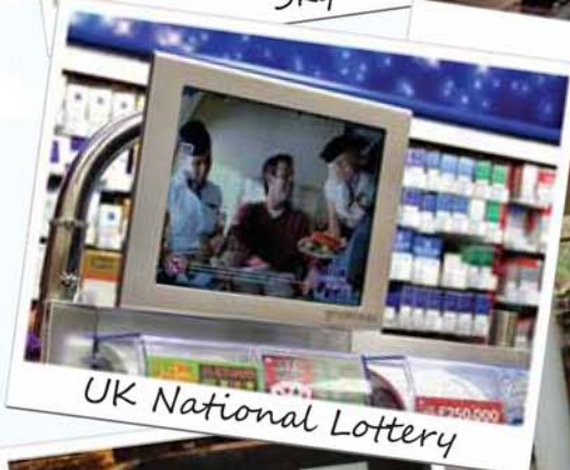
UK National Lottery