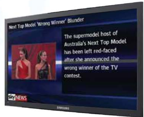
46" LED Samsung SM460EXn with integrated PC.

Visit our website www.signagelive.com for a full list of vendors across the world.