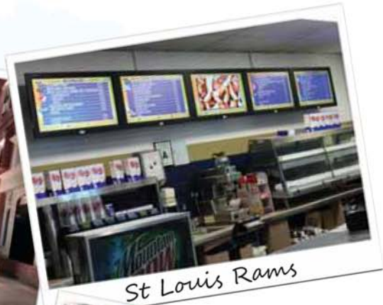
St Louis Rams