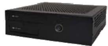
AOpen DE7000 with Intel Core 2 Duo processor.