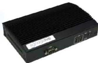
The Advantech ARK-DS303 with on board Broadcom "Crystal HD" hardware accelerator