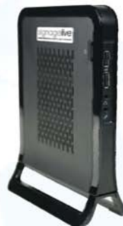
Slim profile Seneca Data i330 digital signage player